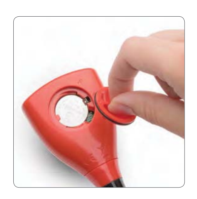
An easily removable cover provides access to the replaceable battery.