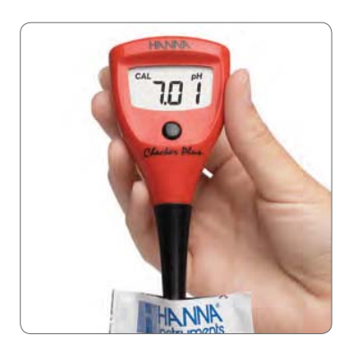
Calibration can be performed directly in our solution sachets.