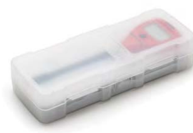
Supplied in a carrying case with buffer and cleaning solutions.

HI98100 (Checker Plus) is supplied with HI1271 pH electrode, pH 4.01 buffer solution sachet (2), pH 7.01 buffer solution sachet (2), electrode cleaning solution sachet (2), battery, quality certificate, and instruction manual in a carrying case.