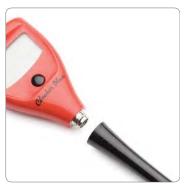
The HI1271 pH electrode can be easily replaced. Just unscrew the electrode from the meter body and screw on a new one.

The HI98100 Checker Plus is supplied complete with meter, probe, calibration solutions, and cleaning solutions packaged in a durable plastic carrying case.